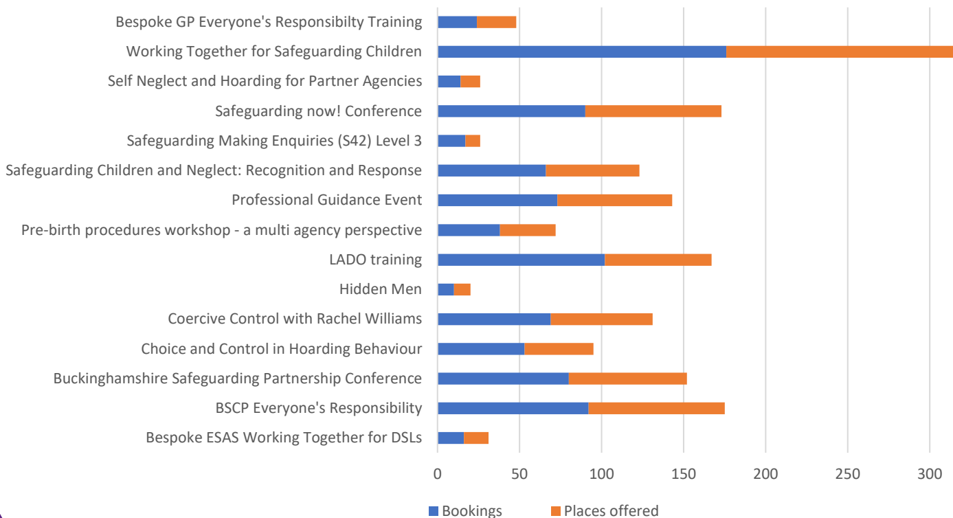
Training 2022-23 takeup

Over 900 multi-agency staff booked on to our training and events, with approximately 800 attending. A full breakdown of figures included in the appendix.